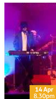
BEST OF THE BEE GEES Tickets $39