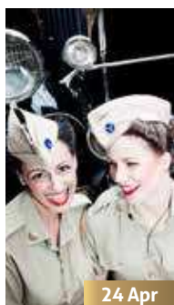
THE ANDREWS SISTERS TRIBUTE