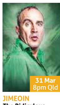
JIMEOIN The Ridiculous Back by popular demand Tickets $44