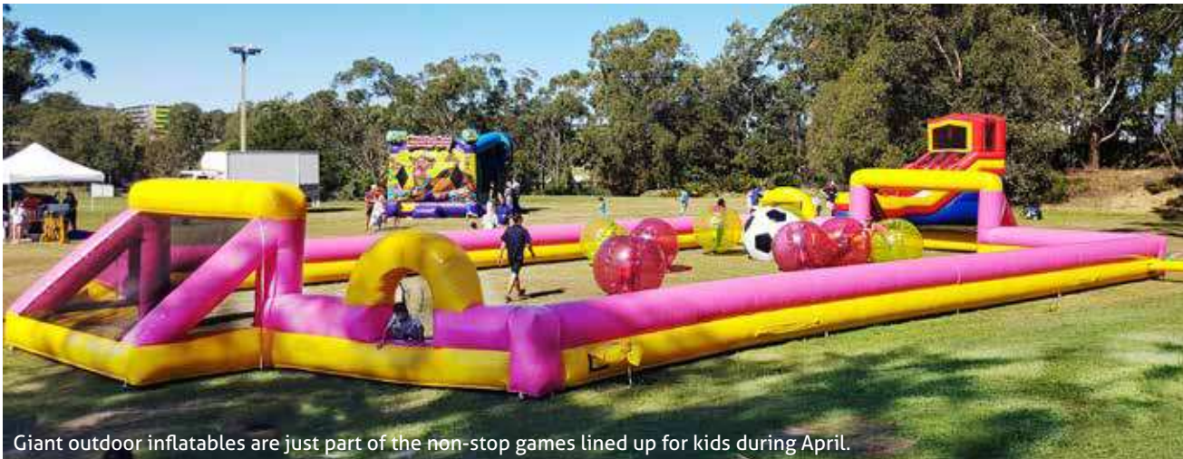
Giant outdoor inflatables are just part of the non-stop games lined up for kids during April.