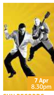
SUN RECORDS ALL-STARS Direct from the USA Tickets $50