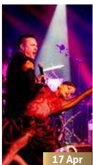
NOT STRICTLY BALLROOM