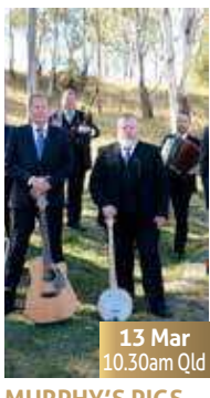
MURPHY'S PIGS Celtic By Nature: Pigs By Choice