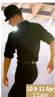
BACK TO THE TIVOLI Tickets $15