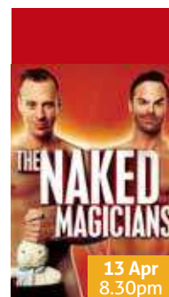
THE NAKED MAGICIANS 18+ Tickets $50 | VIP $75