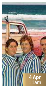
THE BEACH BOYZ SHOW