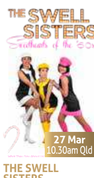
THE SWELL SISTERS Sweethearts Of The Sixties