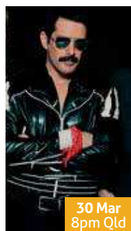
KILLER QUEEN Good Friday Concert Tickets $35