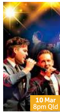
BOYS IN THE BAND Tickets $49