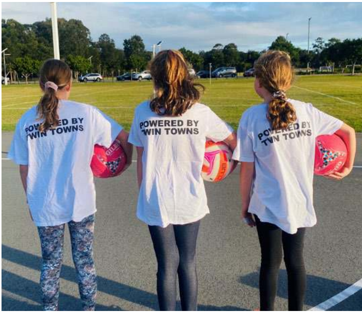
Terranora Netball Club Juniors, powered by Twin Towns