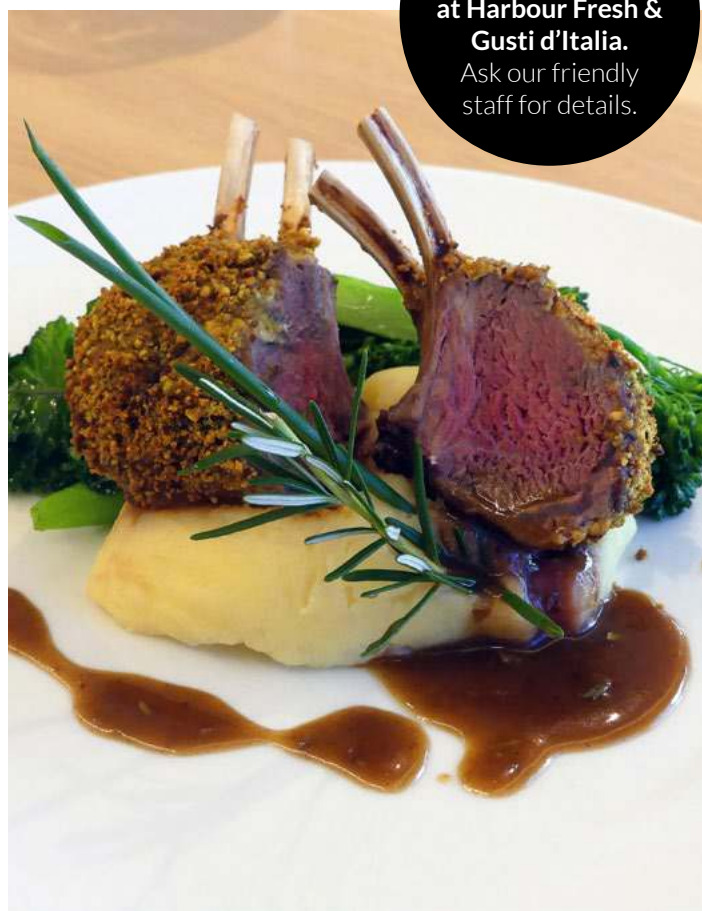
Pistachio herb-crusted lamb rack