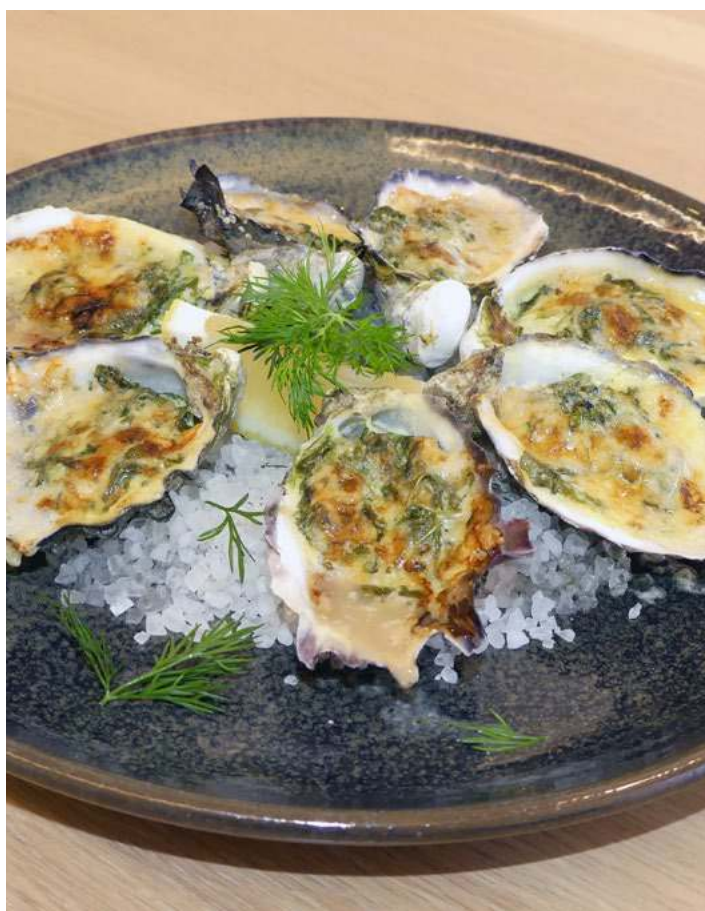
South Australian Pacific oysters

Use your DINING DEALS to downsize your bill at Harbour Fresh & Gusti d'Italia. Ask our friendly staff for details.