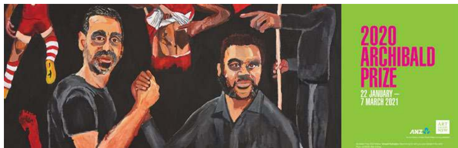
'Stand strong for who you are' by Vincent Namatjira, the winner of the 2020 Archibald prize.

Scan the QR code for details of the 10 finalist artworks featured in the light show at Twin Towns. To learn more, visit the Tweed Regional Gallery & Margaret Olley Art Centre website .