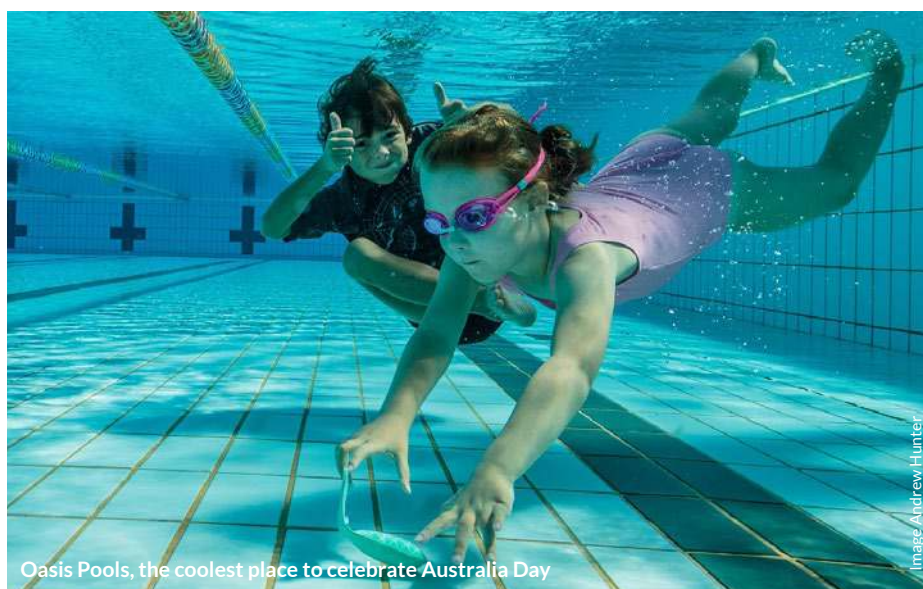
Oasis Pools, the coolest place to celebrate Australia Day

The Oasis Pools Australia Day Pool Party