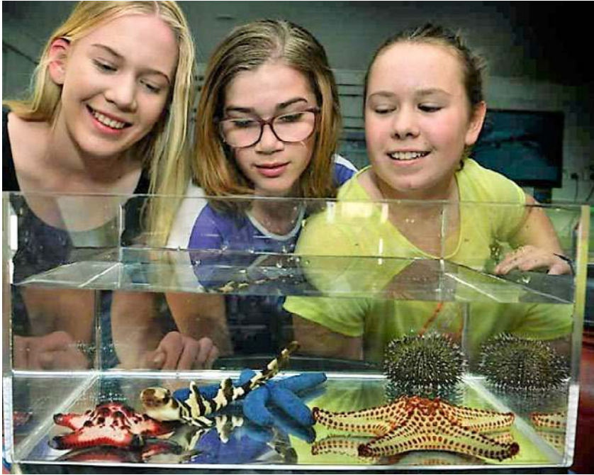
Interactive marine touch tanks coming to Club Banora