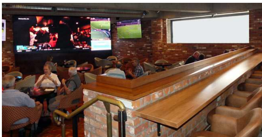
Picture windows bring natural light to the Tavern

If you haven't been there, you should! 1st on Wharf Tavern opens every day, from 9.30am until late.