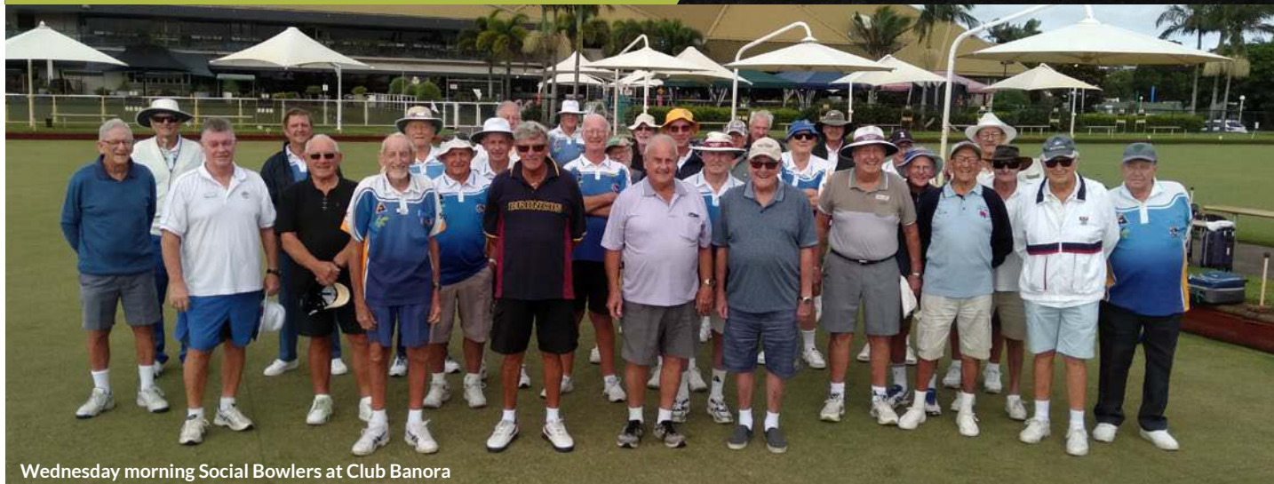
Wednesday morning Social Bowlers at Club Banora