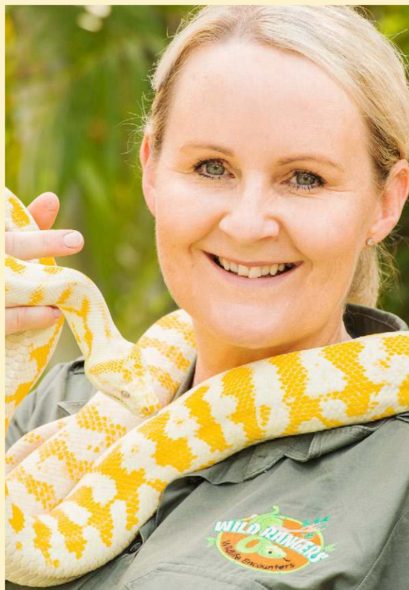
Wild Rangers Wildlife Encounters comes to Club Banora in June.

Club Banora's outdoor playground is fun for kids, every day of the week, all year round. If you're planning a family get-together or kids birthday party, ask about hiring out one of the all-weather outdoor cabanas. Call the Club on 07 5536 2277 for more information.