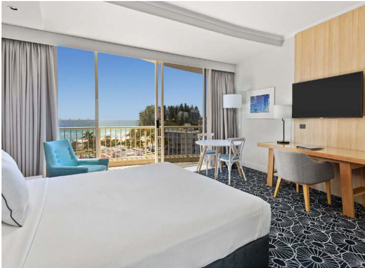
Mantra Twin Towns Resort