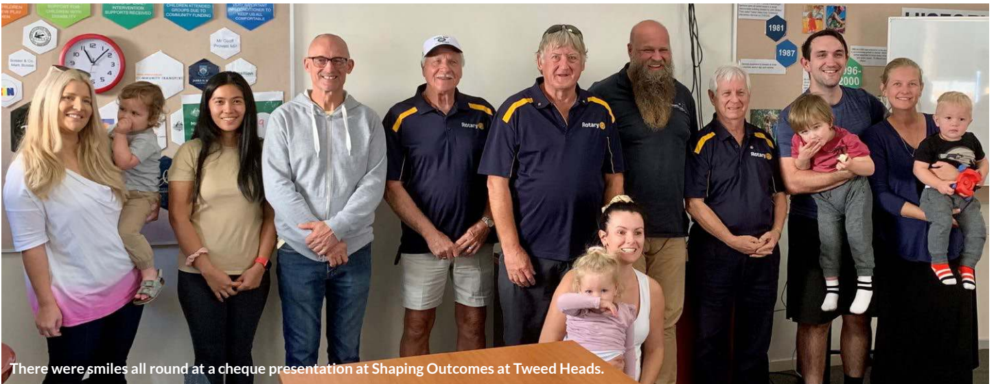
There were smiles all round at a cheque presentation at Shaping Outcomes at Tweed Heads.