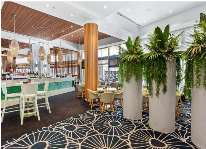
Signatures Lobby Bar