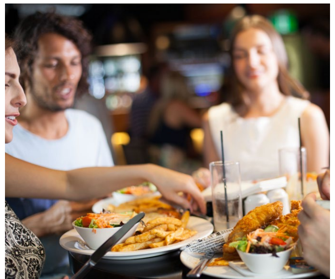
Cudgen Leagues Club will once again be a Club for the ENTIRE community, with bars, dining, entertainment and first-class facilities.