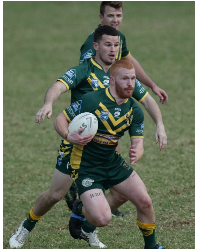
Twin Towns will continue to support ALL local sports.