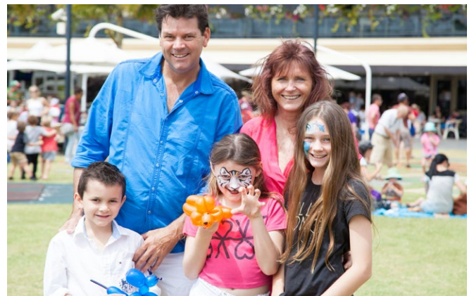
Cudgen Leagues Club will be designed for the family market, following the path of Twin Towns successful community Clubs, Club Banora and Twin Towns Juniors.