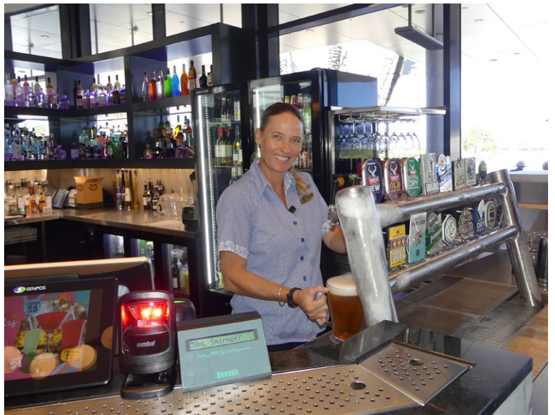
The new Harbour Terrace Bar