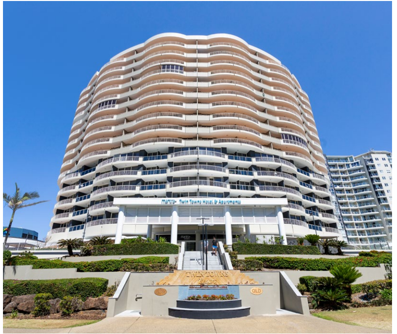
The $10.5M makeover at Mantra is now complete.

“ The future of Twin Towns has never looked brighter. ”