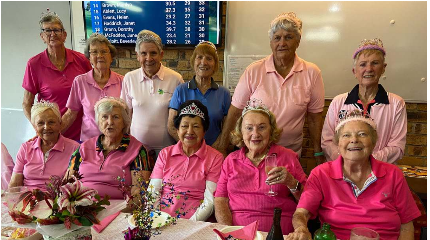
A group of our OBE (Over Bloody Eighty) ladies, celebrating in style

The new year and a new season are already on the go. I hope this season goes a lot better than 2022. This month sees the final of the Men's monthly medal and will be hotly contested by some twenty odd players, qualifying over the past year from all grades, battling for the one trophy. Good luck and great golf to all contenders. The Golf Club's Annual General Meeting is scheduled for Saturday 18 March at 2pm NSW, following a traditional shotgun start game at 8am NSW. The committee positions up for election are – the President, the Treasurer, the Mens Captain and the Ladies' Representative. I am aware that there are a few of the committee who will not be standing for re-election and/or retiring from their current positions early. It will be sad to lose these committee members as we work well as a team and enjoy each other's company and participation. We cannot operate if we don't fill these roles. I know we have great members