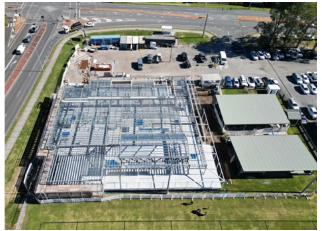
Champions were excited to see how quickly the construction of their new Juniors Club is progressing.

The new Juniors is expected to reopen in November 2023.