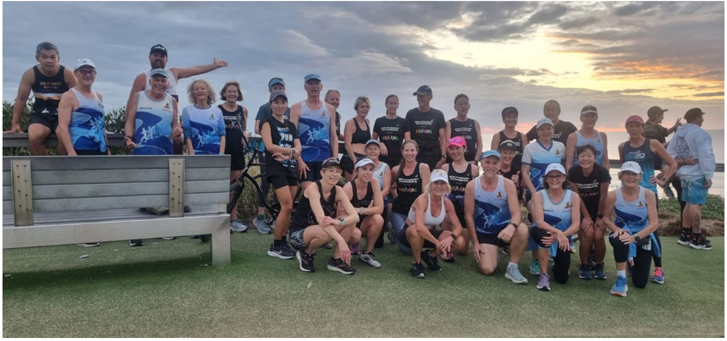
Annual combined run/walk, Gold Coast and Southport Runners and Twin Towns Runners & Walkers

June was a busy month and one of the highlights was our three Club meet at Tallebudgera Creek.