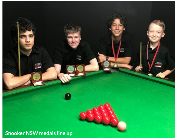
Snooker NSW medals line up