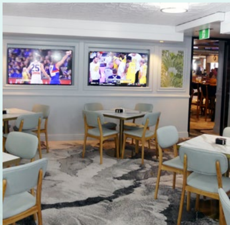
The Lounge at 1st on Wharf Tavern is a comfortable spot for a quiet meal with friends or family

With fresh white walls, striking palm tree wallpaper, timber panelling and a relaxing beachy vibe, The Lounge is perfect if you're looking for a quiet corner for a drink or a meal with your besties, the family or the kids.