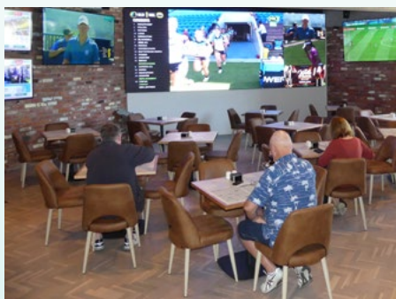
Fresh new décor has brightened up the Tavern

Children are welcome and the kids' menu has all their favourites.