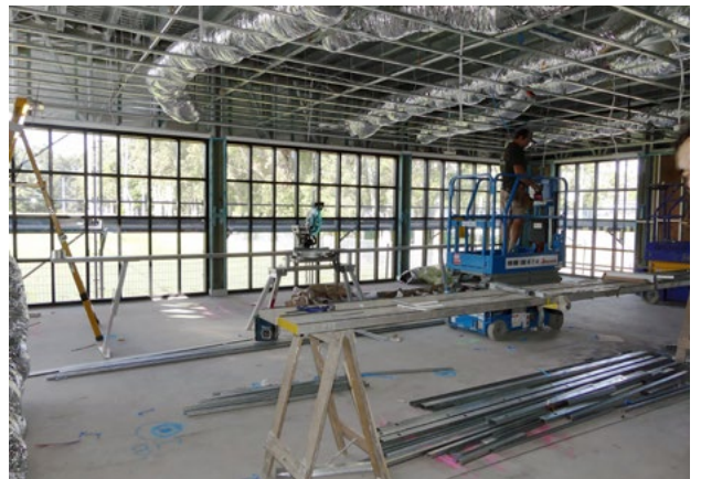
The new dining area overlooks the playing field

At this stage, this new, super-stylish meeting place and entertainment hub for locals, is on track for a November opening.