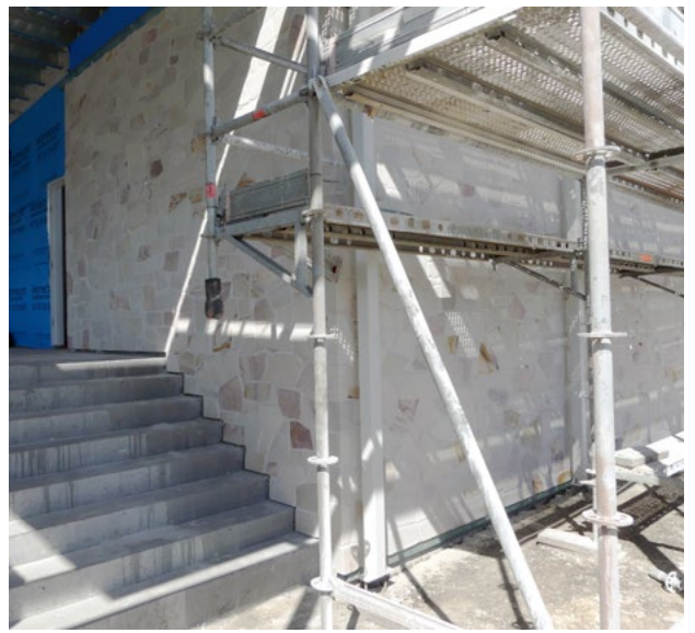
Stonework is a feature of the entry and there is ramp access for those who need it