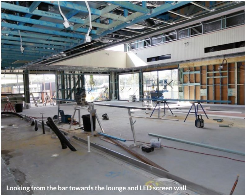
Looking from the bar towards the lounge and LED screen wall