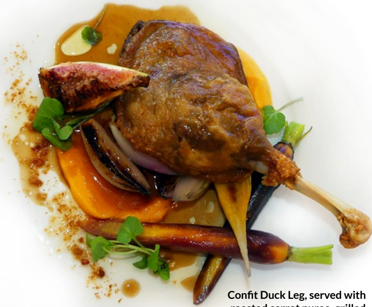
Confit Duck Leg, served with roasted carrot puree, grilled figs and sticky balsamic