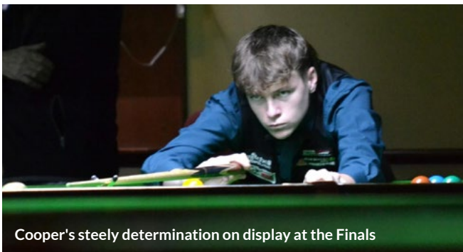
Cooper's steely determination on display at the Finals