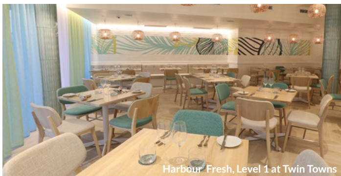
Harbour Fresh, Level 1 at Twin Towns