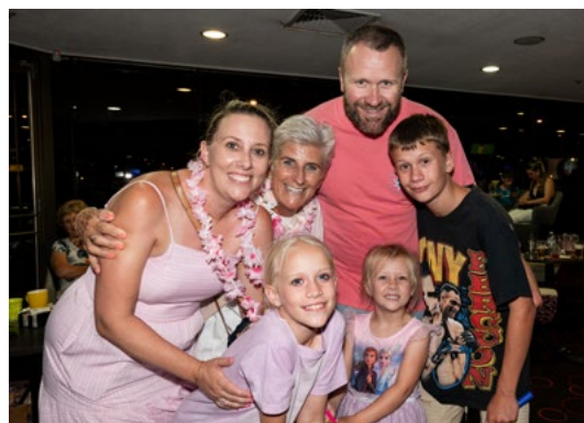
The Cook family