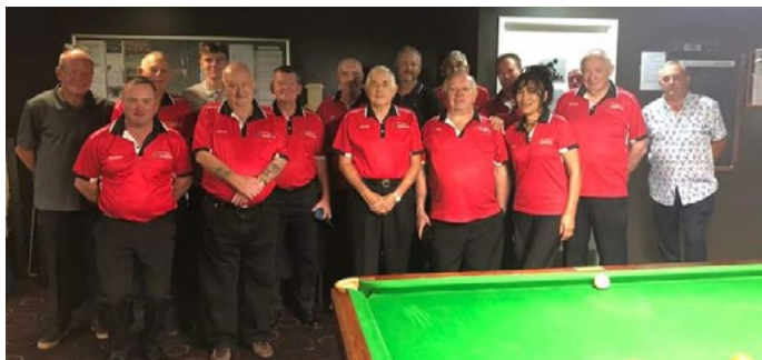
Players from our first sponsored Sunday